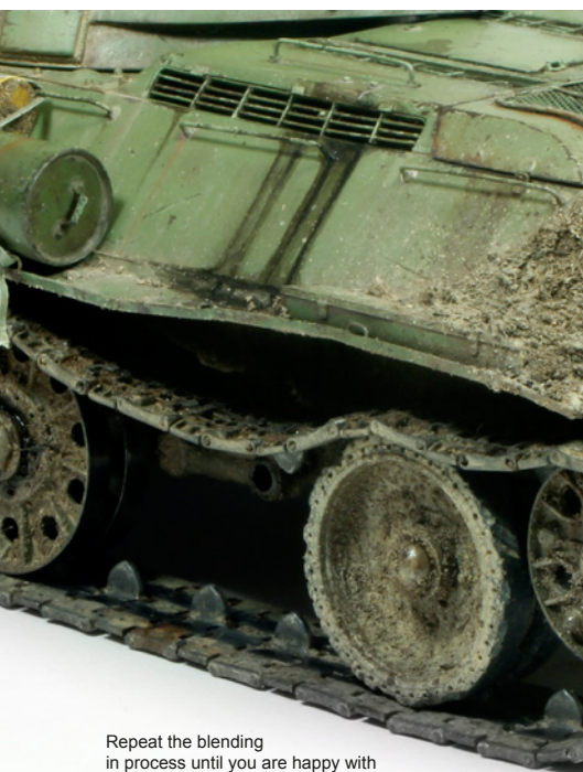
Repeat the blending in process until you are happy with the results. But don't forget variation is key.