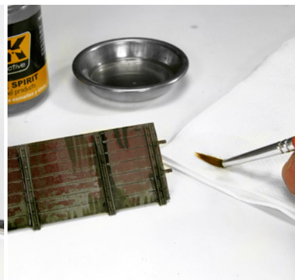
Use a clean brush and AK 011 White Spirit. Remove the excess White Spirit on a tissue or a cloth.